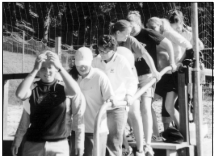
The team building program incorporates a variety of exercises geared toward team bonding and goal setting.

The team members feel that teamwork is the ability to work together toward a common vision and to direct individual accomplishments toward organizational objectives. The California women's golf team believes teamwork is the fuel that allows common people to attain uncommon