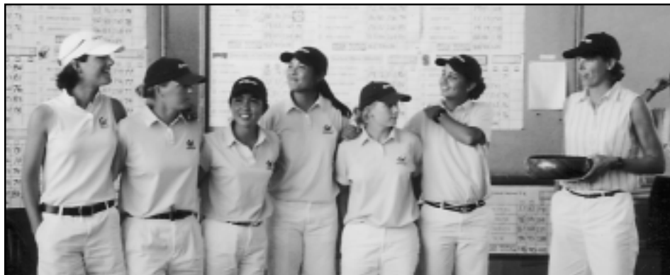
Cal celebrates its victory at the Kent Youel Invitational in Hawaii.

Golfweek and concluded the fall at No. 11. Cal also enters the spring season with an all-time best national ranking of No. 5 by Golfstat and a No. 2 rating for score vs. par of 6.17.